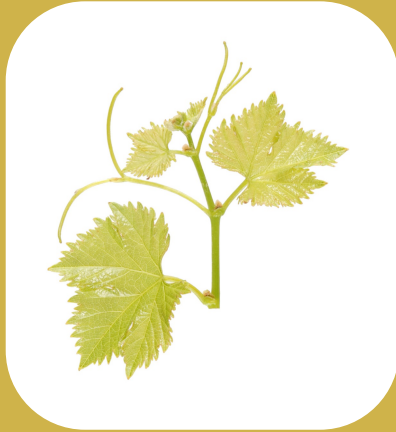
Table grape variety.