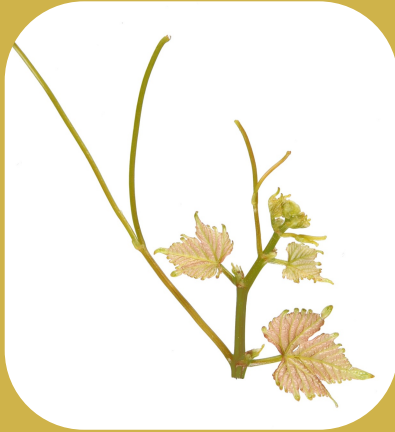
Table grape variety.