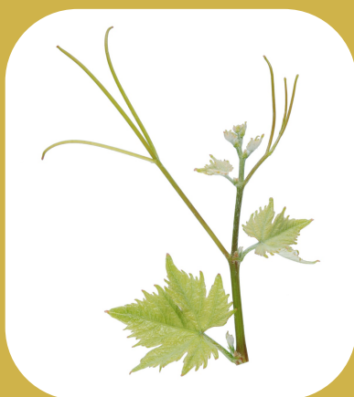
Table and wine grape variety.