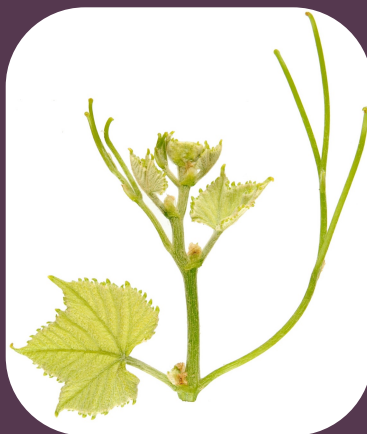
Table grape variety.