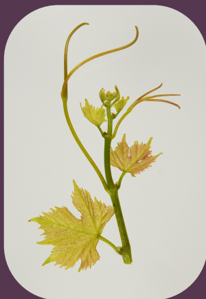
Table grape variety.