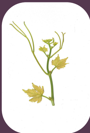
Table grape variety.