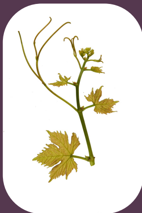
Table grape variety.