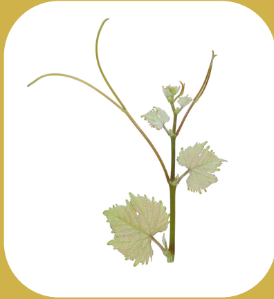
Table grape variety.