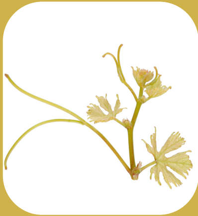
Table grape variety.